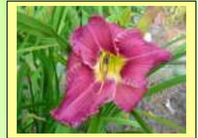
Carrie Turberville