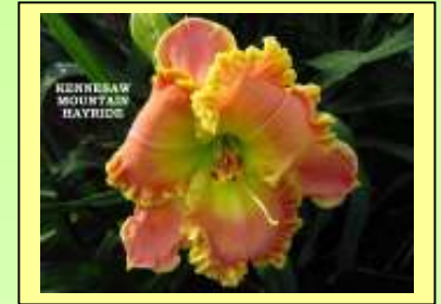
Kennesaw Mountain Hayride