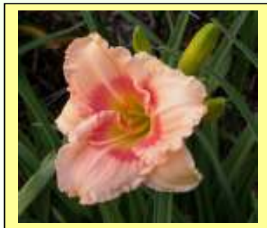
Miracle of St Jude