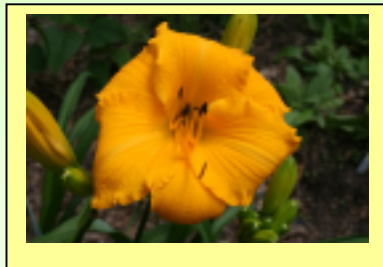
Mary’s Gold

Some hybridizers introduce daylilies named after children, grandchildren and friends, which is a lovely way to fondly remember some special person in our lives.