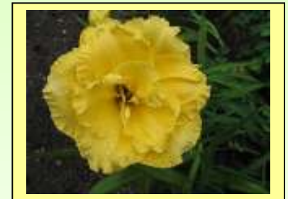
Sydney My Sunshine