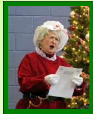
Santa and Mrs. Claus were there to greet everyone ..... and tell us a “daylily” Christmas story.