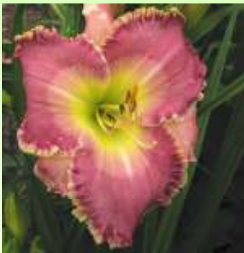
Charles Can't Have It

This mauve pink has a beautiful lavender veined eye that surrounds a bright yellow to green throat providing a striking contrast in any flowerbed. Cream and lavender picotee ruffled edges and raised midribs with dark pink veining. Fertile both ways.